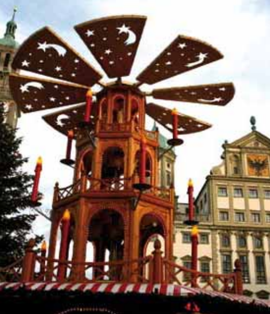
Augsburg Christmas Market