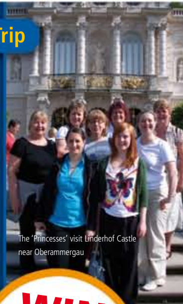
The 'Princesses' visit Linderhof Castle near Oberammergau

It was then off to Munich for some fun Christmas baking at the 4-star Maritim Hotel München. We also visited Nymphenberg Palace, BMW World and Bavaria's most famous beer house, the Hofbräuhaus.