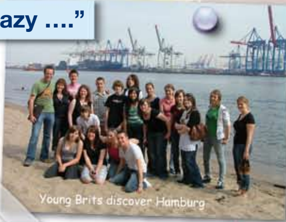
Young Brits discover Hamburg

After two successful trips to Berlin in 2006 and to Cologne/Bonn last year, 15 students from different schools in the UK travelled to Hamburg in July to experience the city from a young person's perspective. The 15-year-old winners of a competition organised by the GNTO and UK-German Connection enjoyed sights like 'Speicherstadt' (Warehouse City), the Fish Market and the new urban development 'Harbour City'. The group also visited a German school, the HSH Nordbank Arena and took part in the 'Schlager Move' Festival where 'crazy Germans' had fun singing along to cheesy music! The British students were the first English visitors to the new International Maritime Museum. A six minute film about the trip can be viewed on www.germany-tourism.co.uk